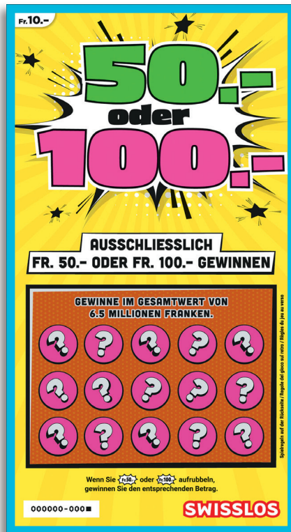
Example: Win Fr. 100.-