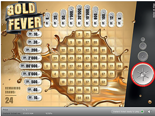
Example: Win CHF 20.-