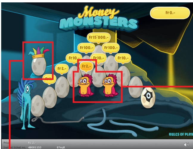
Example: Win CHF 22.–